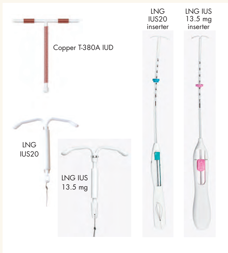
Copper IUD photo courtesy of TEVA Women’s Health, Inc., registered owner of the ParaGard® trademark. For illustration purposes only; image shown is not actual size. LNG IUS product photos courtesy of Bayer HealthCare Pharmaceuticals, Inc., registered owner of the Skyla™ and Mirena® trademarks.

use a backup contraceptive for the next 7 days. 34